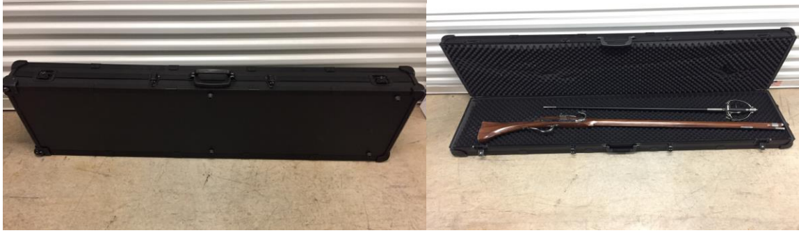
T.Z. Case International TZM0062 B 62 x 16 x 6-Inch Ultra-62 Tactical Case