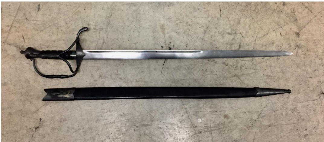
English Half-Basket Hanger/Tuck Sword