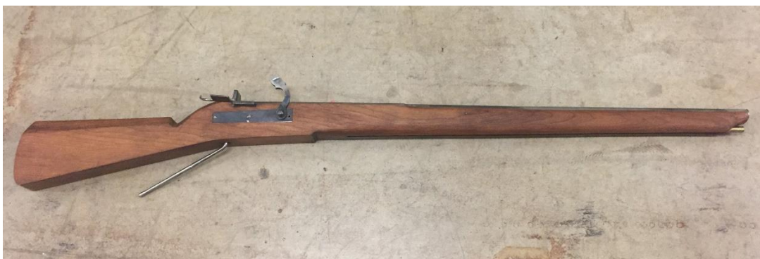
Matchlock Musket from Skye's Sutlering

2. Skye's Sutlering in Claremont, VA. is another source for matchlock muskets. The matchlock muskets offered by Skye's are custom made by a gunsmith in Virginia and are shorter in length than that of others which makes them easier to transport when traveling by air thus can be an advantage. www.sykessutler.com