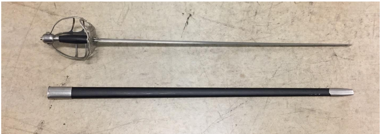
Practical Mortuary Sword