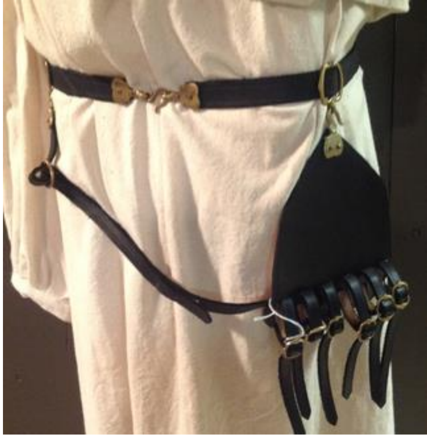
Thin Sword Belt

If one is wearing Pikeman's armor, the belt on the armor can serve as the sword belt with adding only what is known as a frog to hold the sword. If one chooses such a frog, it should be one where the sword is carried at an angle.