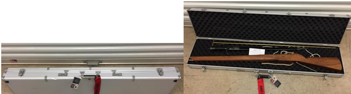
TMS 53" Long Aluminum Locking Rifle Gun Case

Armor can be easily packed in a large 30-inch roller suitcase. Suitable suitcases can be purchase locally or order on-line from a variety of vendors for approximately $90. Laundry bags are useful to protect the armor and can be purchase on-line.