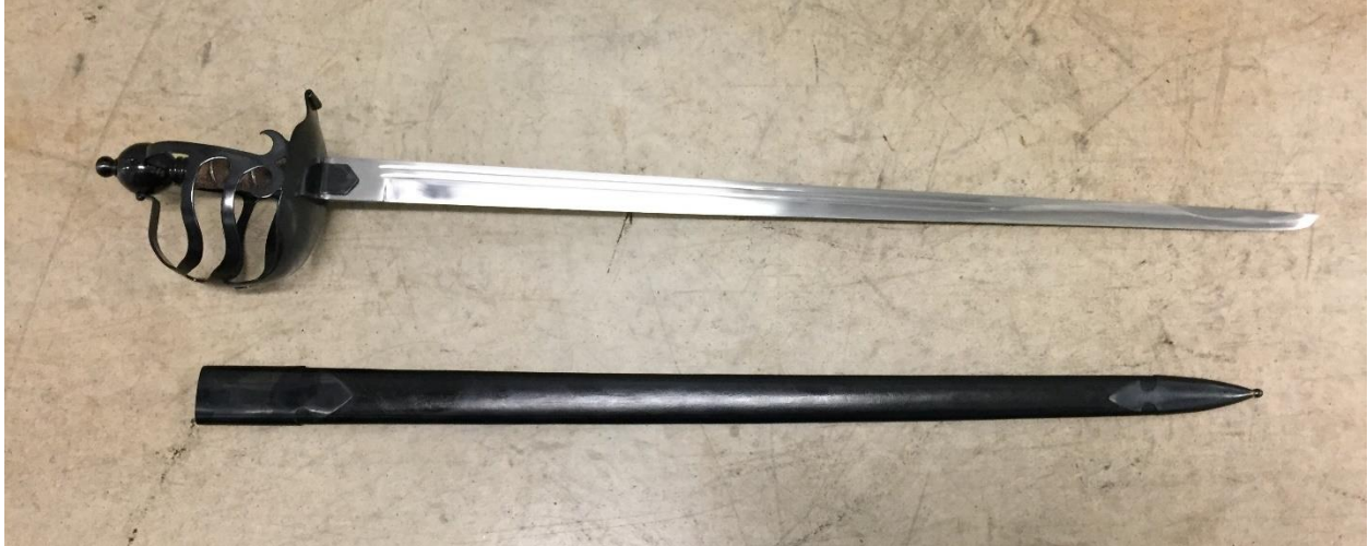
Full Length Mortuary Half Basket Sword