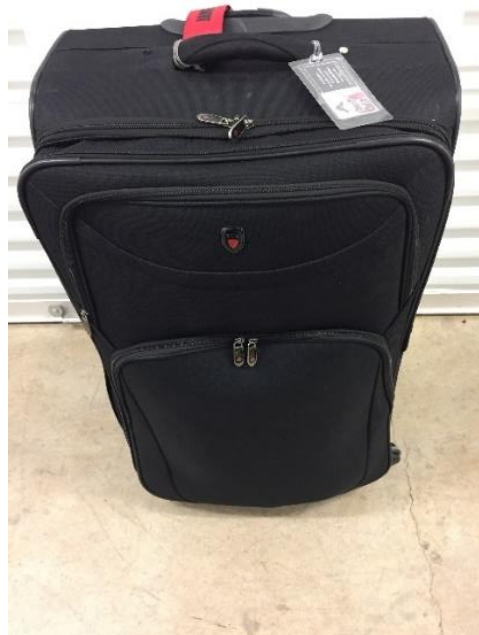
30-inch Roller Suitcase

Armor can be easily packed in a large 30-inch roller suitcase. Suitable suitcases can be purchase locally or order on-line from a variety of vendors for approximately $90. Laundry bags are useful to protect the armor and can be purchase on-line.