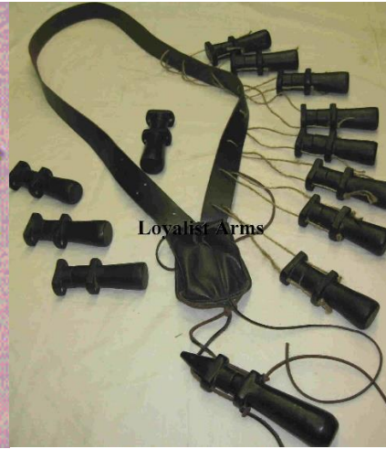
Bandoliers & Apostles Loyalist Arms

There are multiple sources for bandoliers & apostles at all approximately the same price ($150)