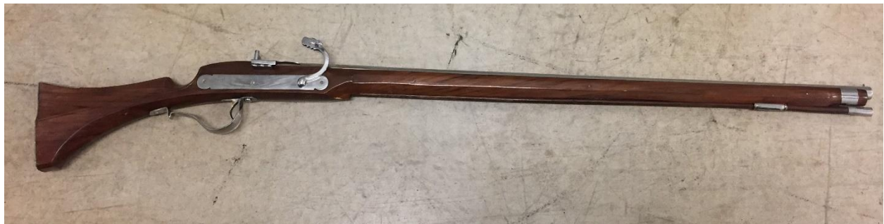
Matchlock Musket from Access Heritage

The most common musket used by the Pilgrims was the Matchlock Musket. There are many sources for Matchlock Muskets. The Mayflower Guard will be using non-firing muskets.